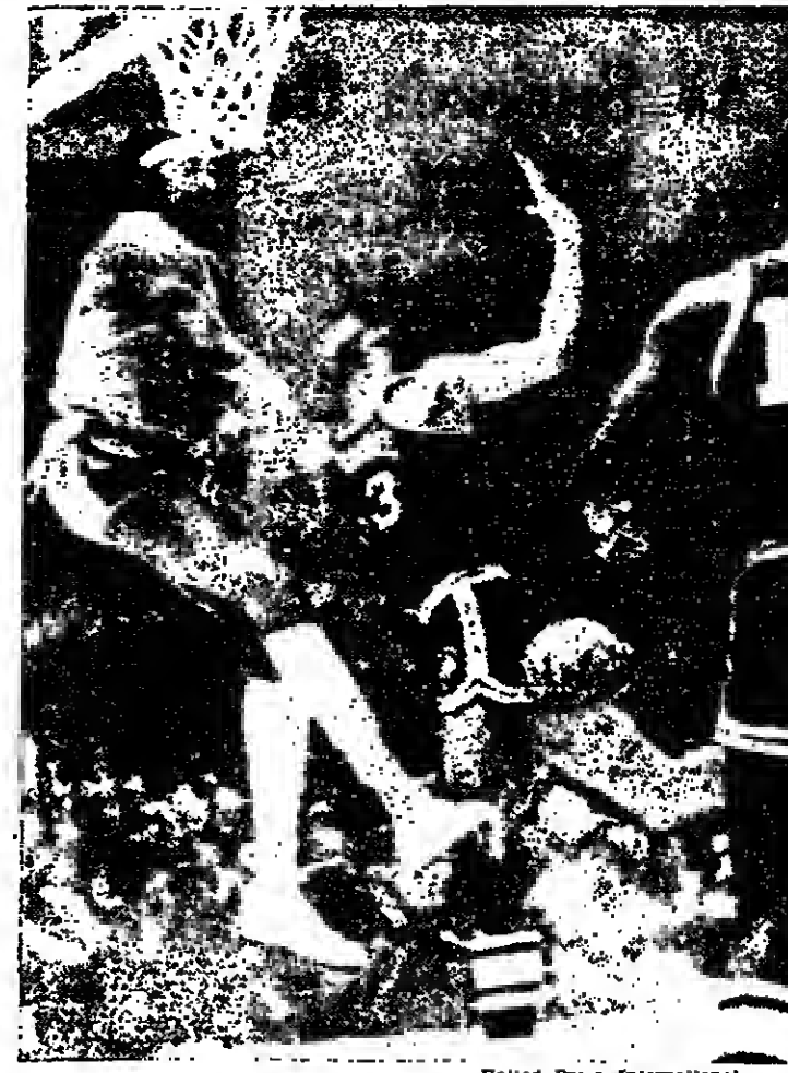
GIVES IT BACK—Lakers' Wilt Chamberlain slaps away shot by Bucks' Lew Alcindor, but Milwaukee still clinched NBA's Western Division title Sunday with a 116-98 victory.

New York 2, Chicago 1 (Ratelle, Stenkowski, Koroll). (Rangers lead best-of-7 series, 1-0). Montreal 4, Boston 2 (P. Mahovlich, B. Suter, Tremblay; Bucyk, Hodges). (Canadiens win best-of-7 series, 4-3).